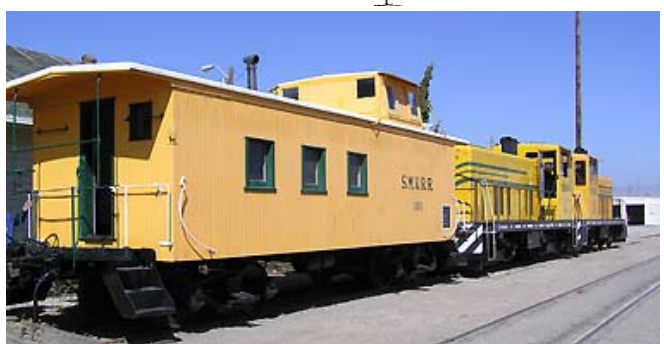
September 2, 2004. SMVRR Caboose No. 180 is placed at the depot by back-to-back SMVRR 70-tonners.

The car was then purchased by Betteravia Farms and spent many years on the end of a spur track off S. Blosser road, where it had fallen into disrepair. The caboose attracted the attention of the railroad museum in 1999, and when asked, Milo Ferini, owner, donated the caboose to the museum.