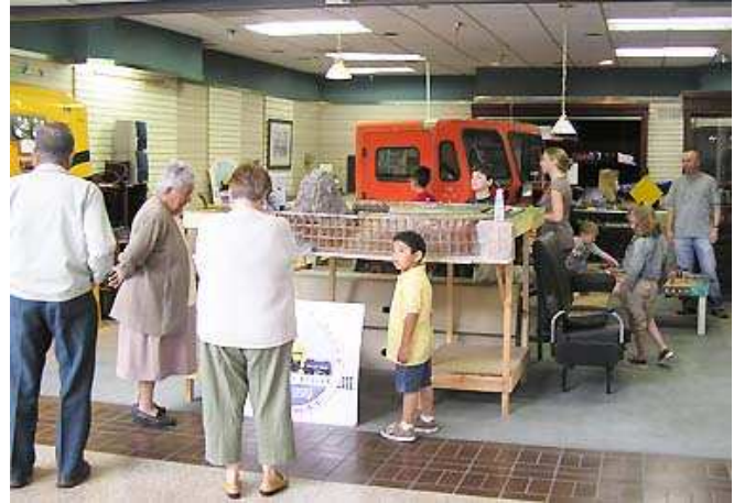
The people were enjoying the Museum in the new space even before we were quite ready! 🚂

The last four days of June saw the Museum moving to a new space in the Mall, just a couple doors down from the "old" space (second level, Sears' wing).