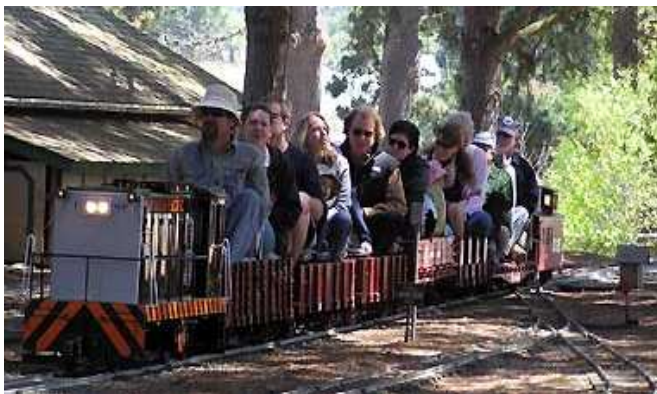
The two Choo Chew Saturdays each year (the next one is September 22nd) are major fundraisers for the SMVRHM. 🚂