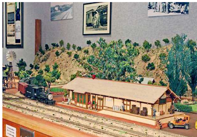
Busy day at the Los Olivos station.