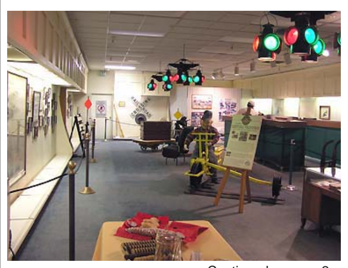
Continued on page 2...

Cookies and punch were available to the many folks that came by that afternoon to see the new displays and layouts in this much more spacious area. In fact, some folks declared that it looked like a real museum!