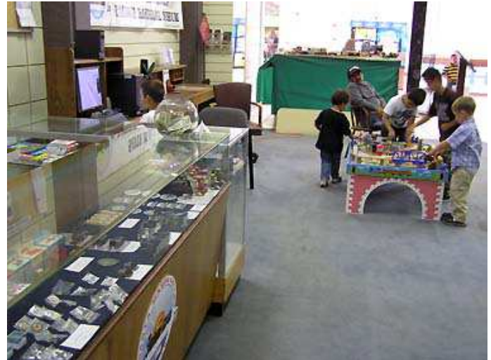
The Museum is open for business again after a mid-summer move to the space next door.