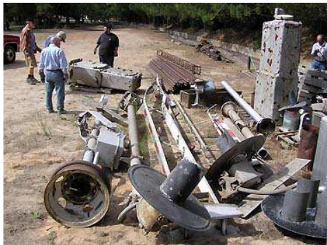
Pictured above is the crew loading the last wooden crossing gate used on the Santa Maria Valley Railroad. At left is how the "display" looked when the movers left Bitter Creek.