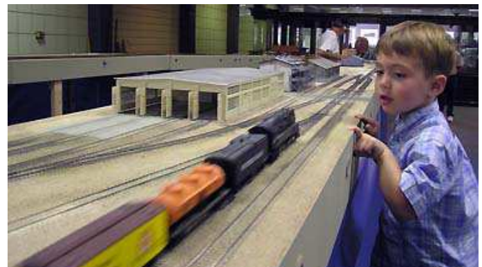
There's an operating loop now on the HO layout, including the downtown yard and the Guadalupe exchange.