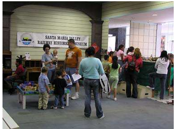
The museum has been seeing several hundred people through each weekend day.