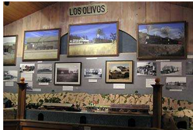
Los Olivos section, with the warehouse, the station, and Mattie's Tavern on the layout.

Remaning on the lecture series accompanying this temporary display, Sundays at 2pm at the SYV museum: